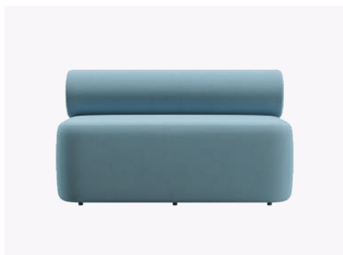
MOSS M 1200 H750 W1200 D820 SH450 MM