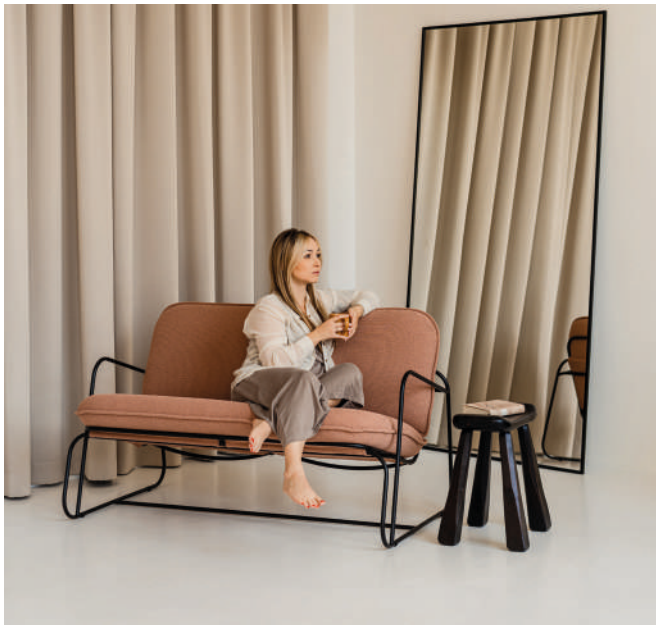
Sofas & Armchairs

Available in different colors and upholstery options.