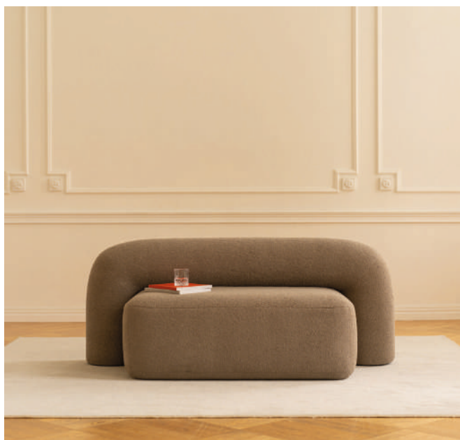
MOSS 1800 H750 W1800 D820 SH450 MM