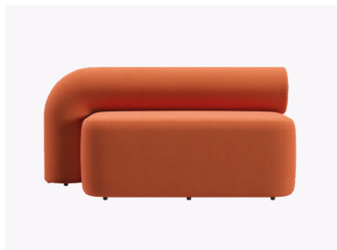
MOSS M 1500 H750 W1490 D820 SH450 MM