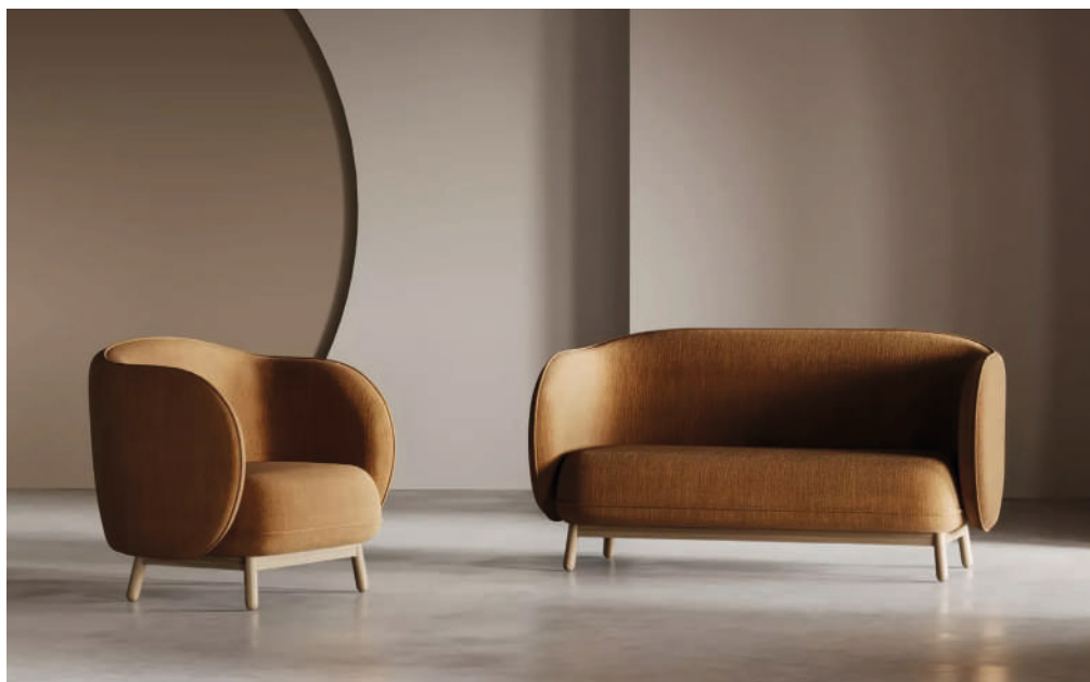
Sofas & Armchairs

The armchair and sofa can be produced in any upholstery of the customer's choice.