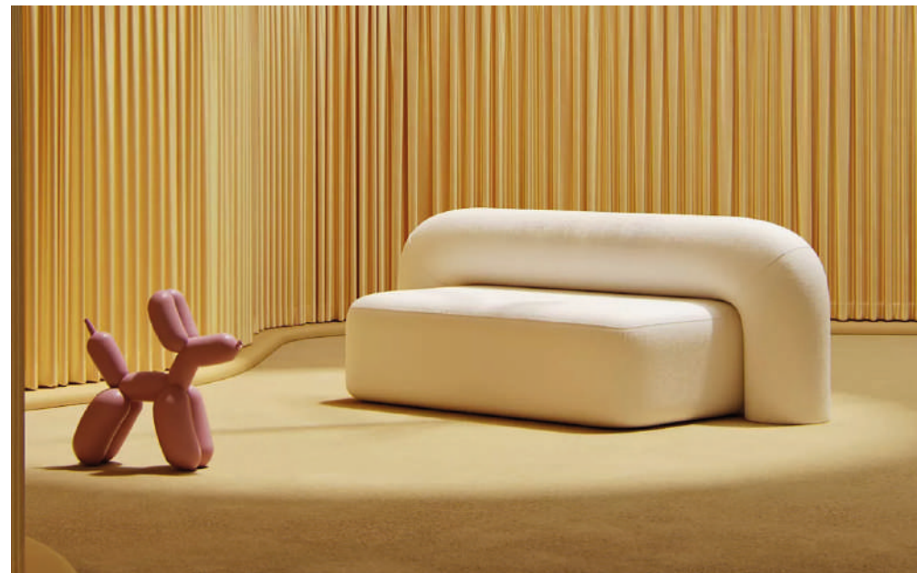
MOSS 2400 H750 W2400 D820 SH450 MM