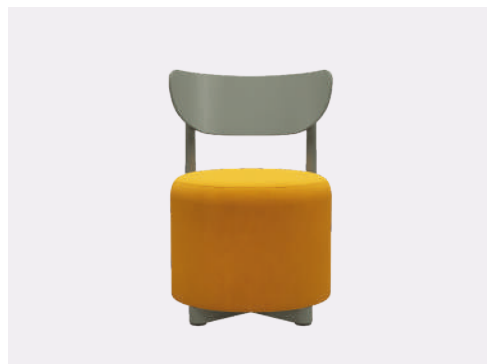
THE FAMILY C H759 W530 D526 SH437 MM