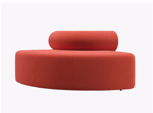
MOSS M 1270 H750 W1270 D1270 SH450 MM