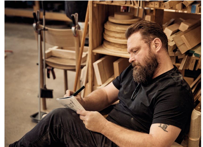
Products: The Family (p. 54).