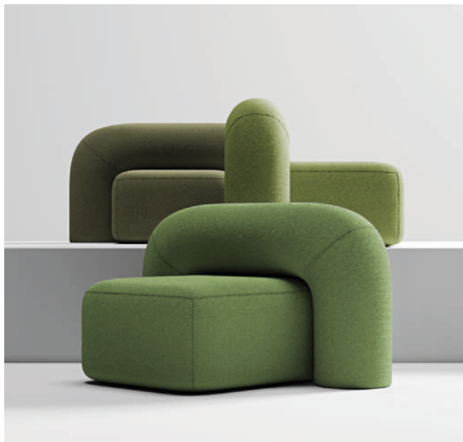
MOSS 1300 H750 W1300 D820 SH450 MM