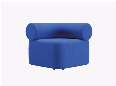
MOSS M 820 H750 W820 D820 SH450 MM