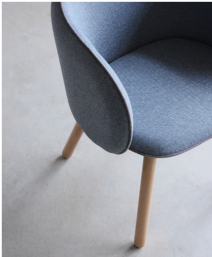
Chairs & Bar chairs

This armchair can be produced with any upholstery according to customer wishes.