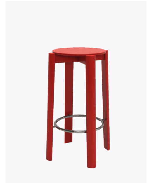
EDDIE HALF BAR

Metal, beech, veneered plywood H790 W468 D468 MM