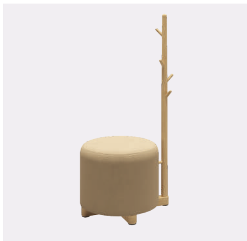
THE FAMILY H H1257 W500 D635 SH437 MM