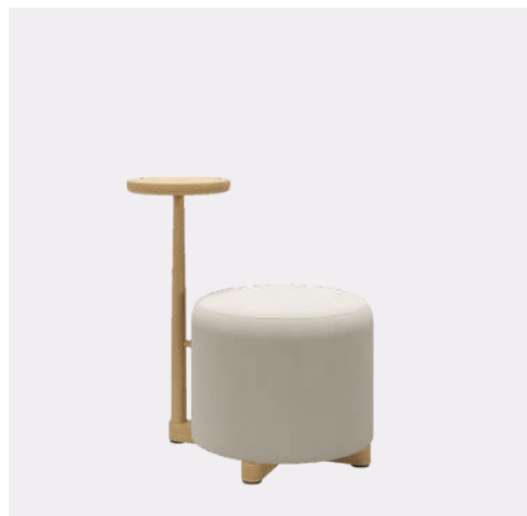
THE FAMILY T H750 W500 D720 SH437 MM